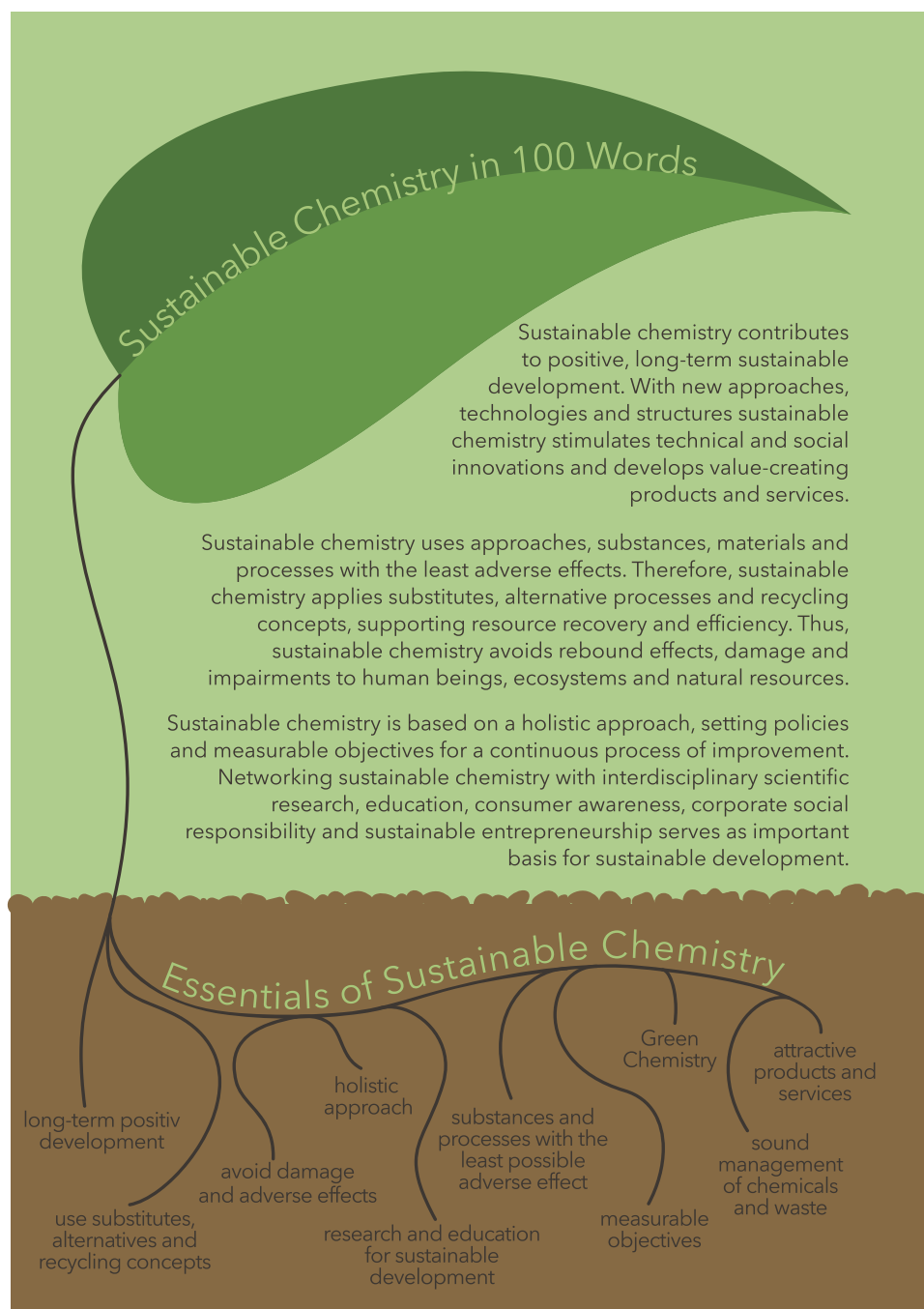
Fig. 1. Sustainable chemistry in 100 words.

use of chemicals. Sustainable chemistry is building on and goes beyond these two concepts. Moreover, this encompasses system innovations which will lead to fundamental changes in both social dimensions (values, regulations, attitudes etc.) and technical dimensions (infrastructure, technology, tools, production processes etc.) and, very importantly, in the relations between them.